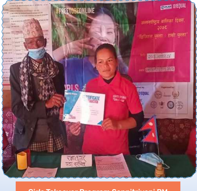
Girls Takeover Program Sannitriveni RM

Initiative action by CoC participants against girls trafficking (rescued 4 girls of Raskot municipality)